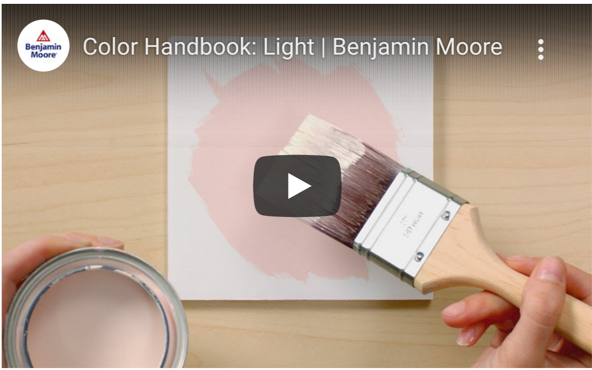
Tip: Paint on a poster board, not a wall, so you can easily see how colors will appear around the room.

While you may be tempted to use color swatches only to determine which color to use, the best way to test color in different lighting conditions is to buy paint samples from your local Benjamin Moore retailer . Natural and artificial light can impact the appearance of color, so viewing it at different times of the day in all lighting conditions is crucial. Learn more about paint color samples .